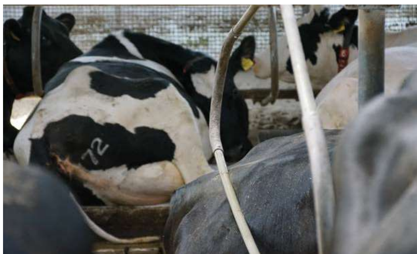
The 'Fitbox' gives way to the movement of the cow.

Cow comfort and thus a longer productive life have to be on a higher level, the flexible 'Fitbox' from Spinder fulfills this. If a cow touches the cubicle divider when standing up or lying down, the cubicle divider springs up and pushes back; not annoyingly or incriminating, but pleasant. The narrow profile of the cubicle divider makes the space optimally utilized; more space for the cow. At the same time, this narrow profile gives the farmer also a better overview of his barn, as there is less material in view. Being fit is important; even for a cow. The farmer who is looking for just that little bit more comfort for his animals is going to discover the 'Fitbox' and thus improve the productive lifespan of the herd.